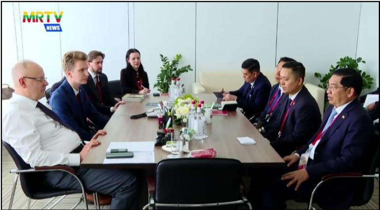
Vice-President U Nyo Saw receives a delegation led by the Adviser to the President of the Russian Federation and Executive Secretary of the Forum Organizing Committee